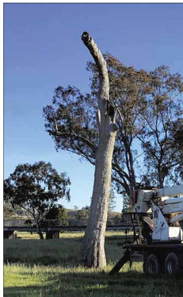
The tree at the start of the morning. -S