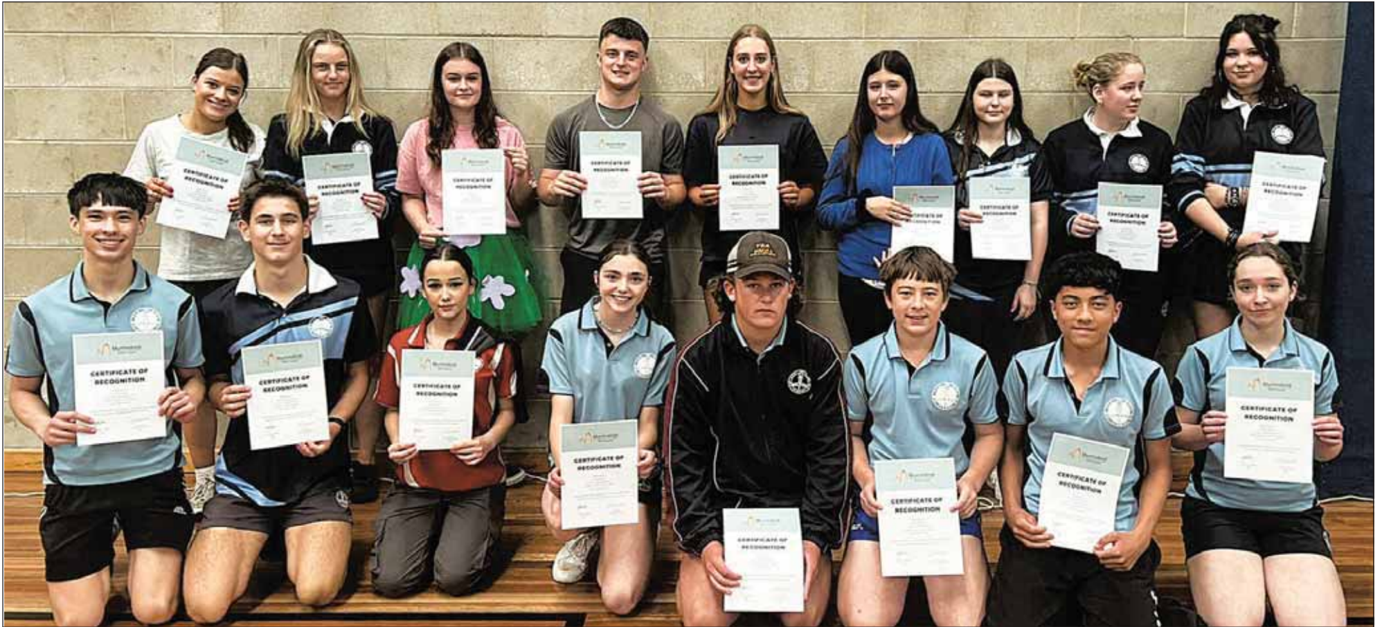
The house captains with their Murrindindi Shire Recognition Awards. -S