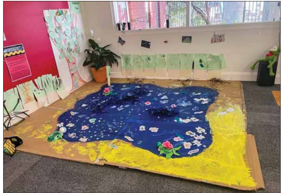
Children worked together to create this pond and the surrounds at the Yea Library.

"Upcoming events that may interest local families include our FrogID Week talks in Alexandra, Kinglake and Yea Wetlands. These involve a 45 minute webinar and a walking excursion in your local area, be it along UT Creek or the Yea Wetlands, to find frogs and record them on the FrogID app."