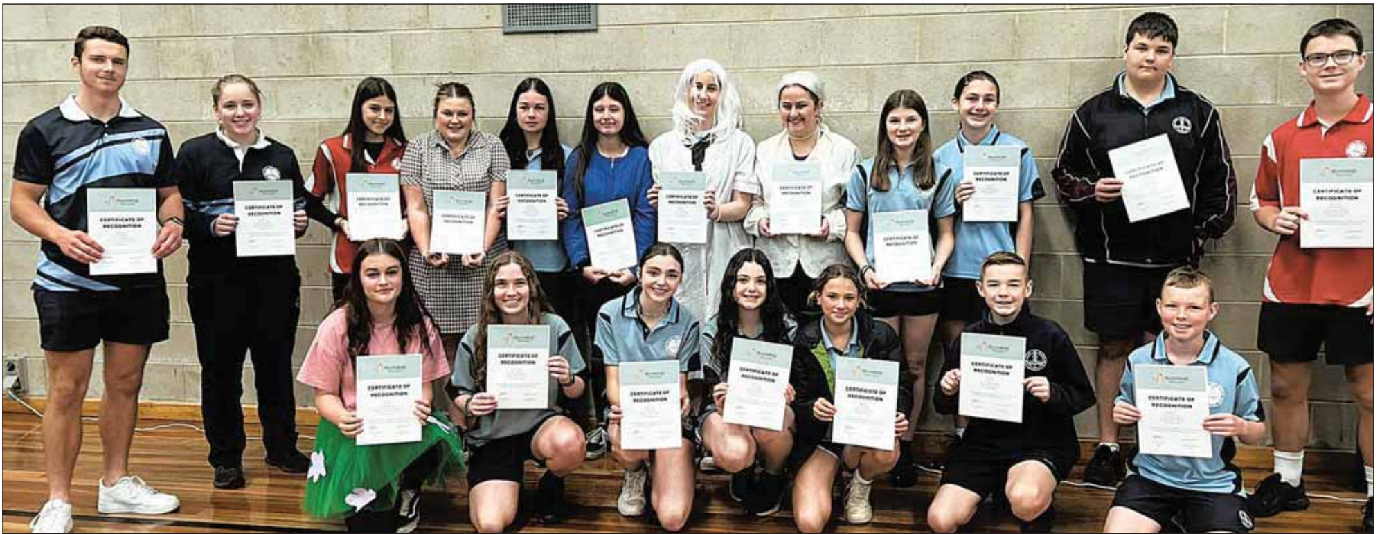
The student leaders with their Murrindindi Shire Recognition Awards.