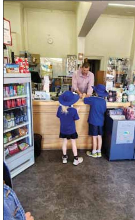
Students purchasing stamps. -S