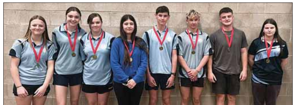
The athletics award winners.