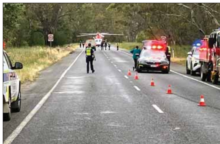
Emergency services, including the HEMS helicopter, near the location of the collision in Molesworth.