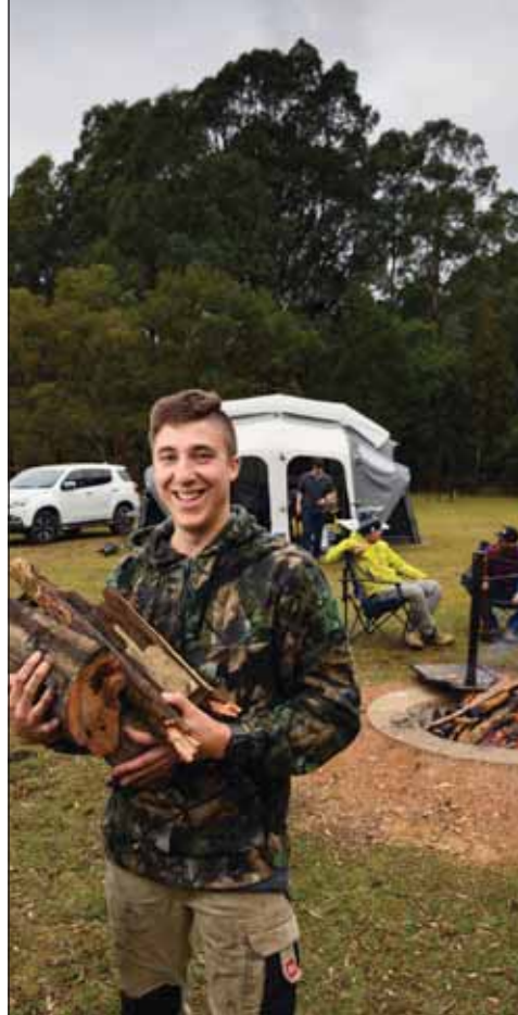
Campers are being urged to make sure they follow the rules around campfire safety. -S

All native wildlife is protected by law. Harassing, harming or disturbing native birds and other wildlife is illegal in Victoria and penalties apply. To report wildlife crime, call Crime Stoppers Victoria on 1800 333 000.