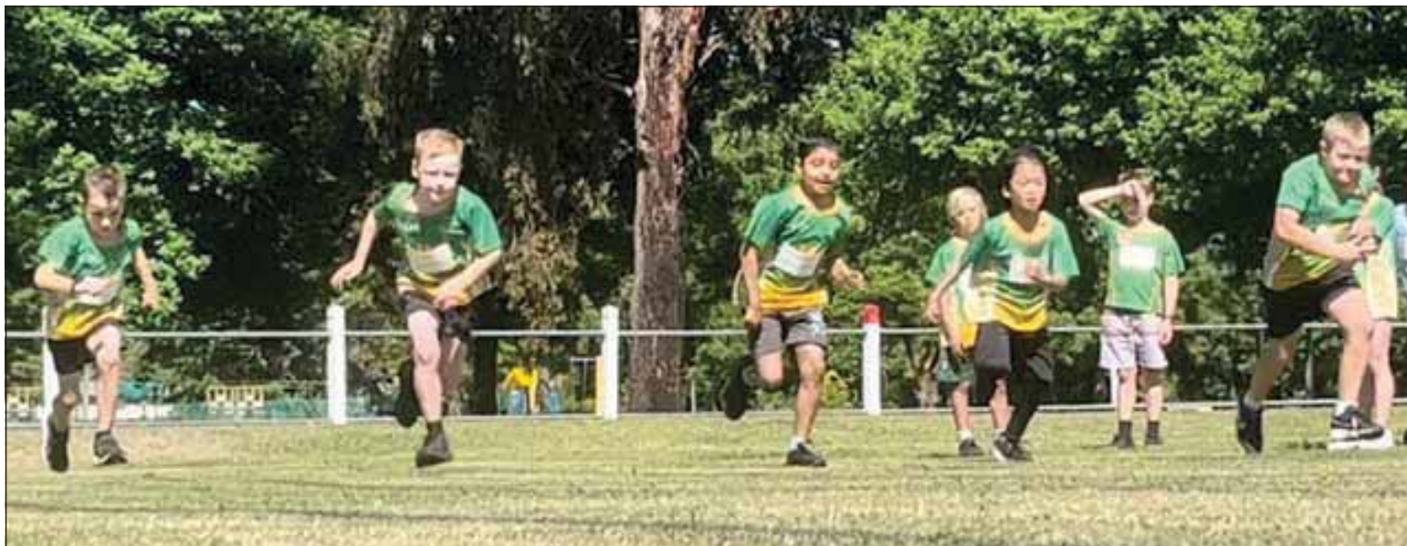
Juniors taking off in the 100 metre race.

To top off the day, athletes wrapped up with a fantastic relay training session, practicing their baton changes. This year, the club is sending its largest team in years to the Regional Relay Event in Shepparton on Sunday, November 17.