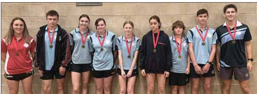
Cross country award winners. -S