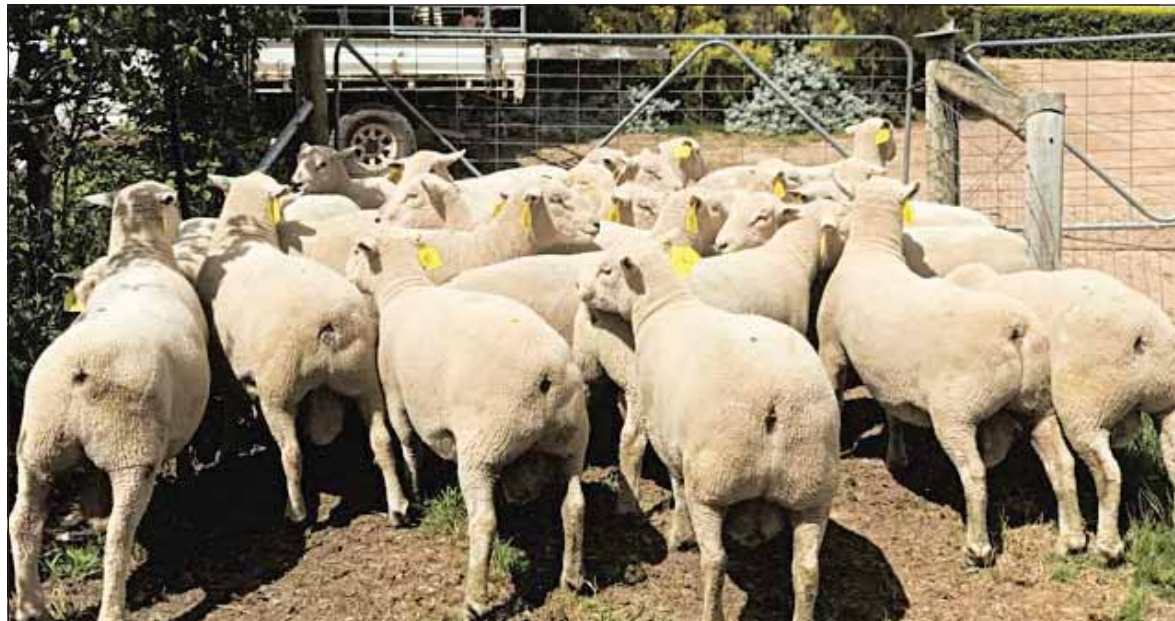
A group of the sale rams.