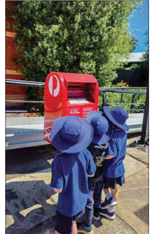
Posting a letter. -S