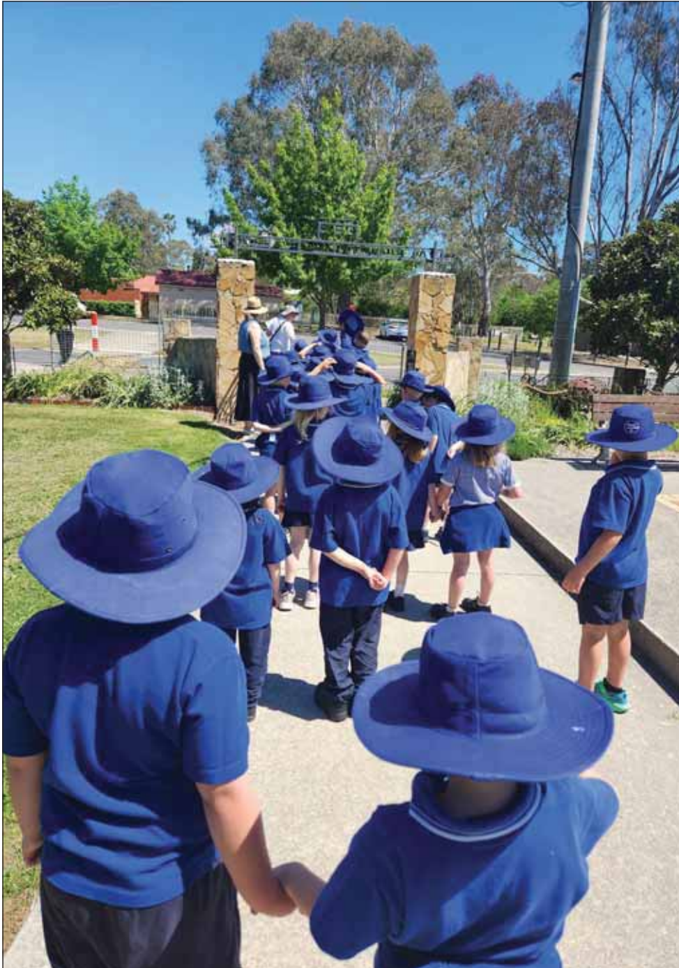
The students leaving school, bound for the post office.