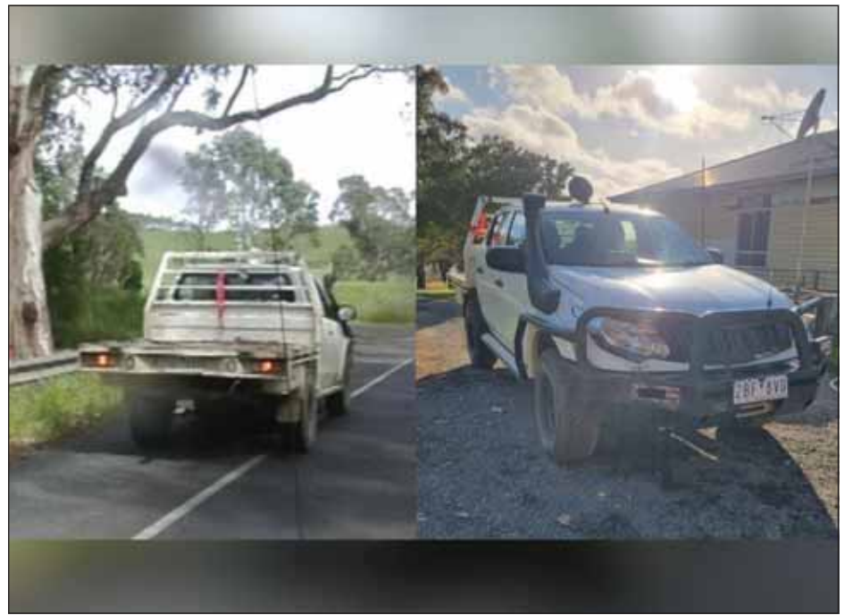
Have you seen this ute?

Anyone with information is urged to contact Crime Stoppers on 1800 333 000 or submit a confidential report at crimestoppersvic.com.au