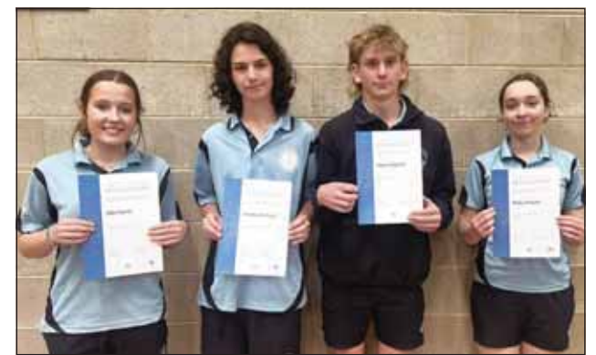
The NAPLAN high achievers. -S