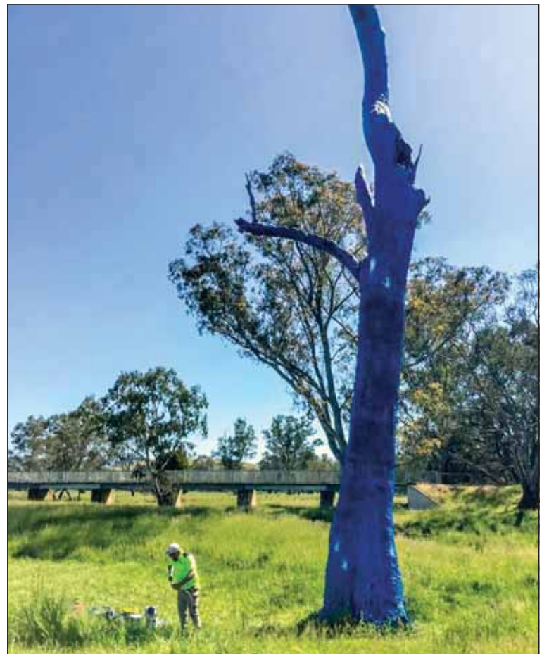
The finished project. -S

If you want to find out more about the blue tree project visit bluetreeproject.com.au