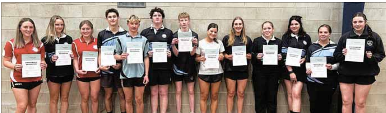
The bus captains were recipients of Murrindindi Shire Recognition Awards. -S