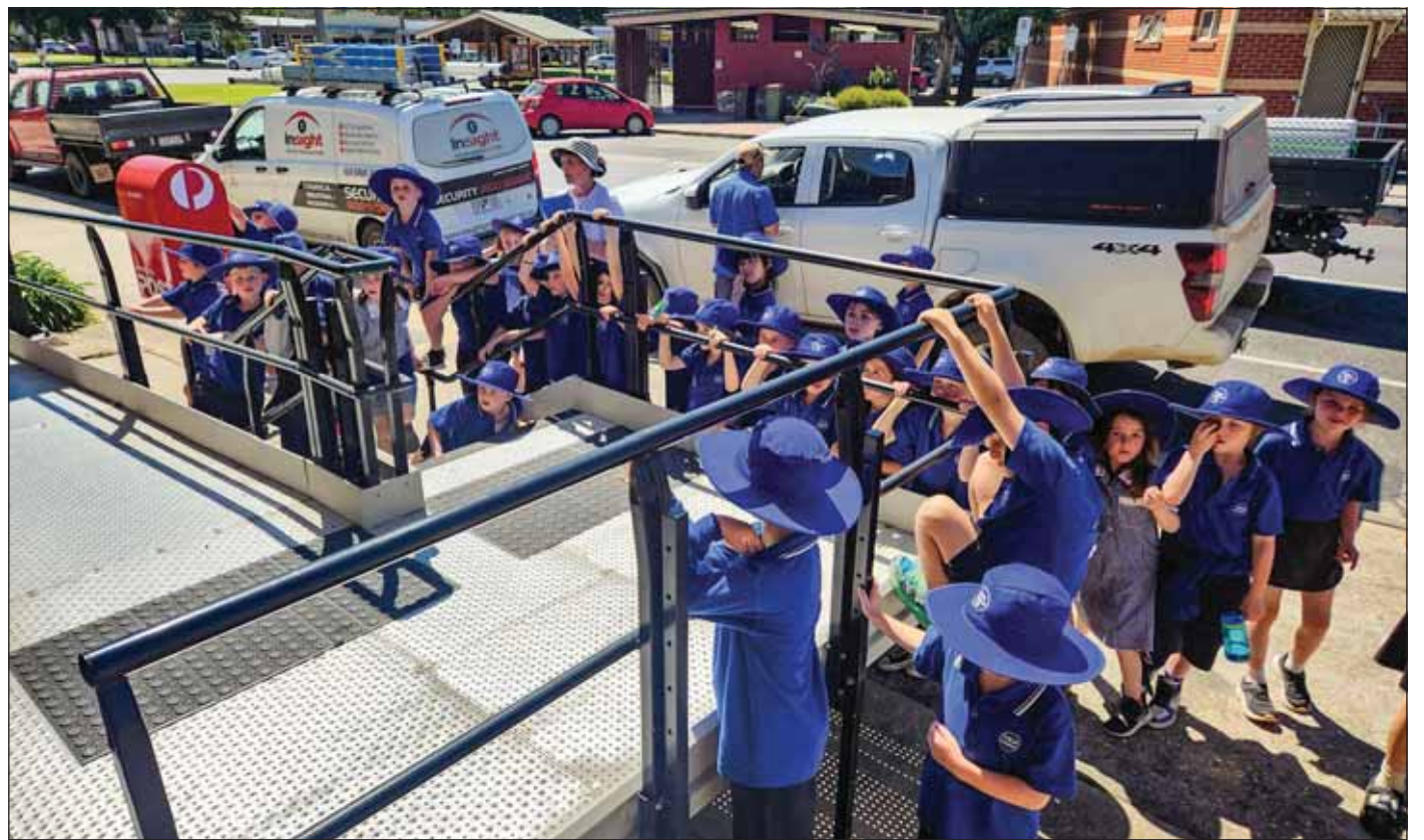
Yea Primary School students outside the post office. More on page 5 of this edition.